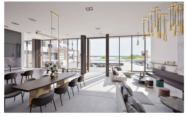
DRAFT: SOCIAL LOUNGE