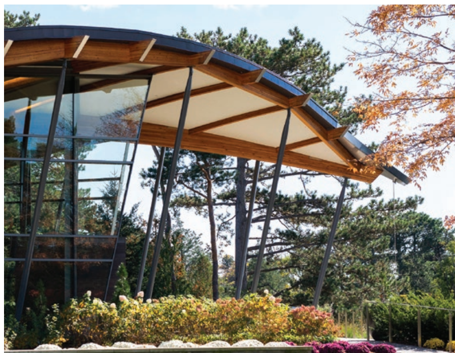
Royal Botanical Gardens