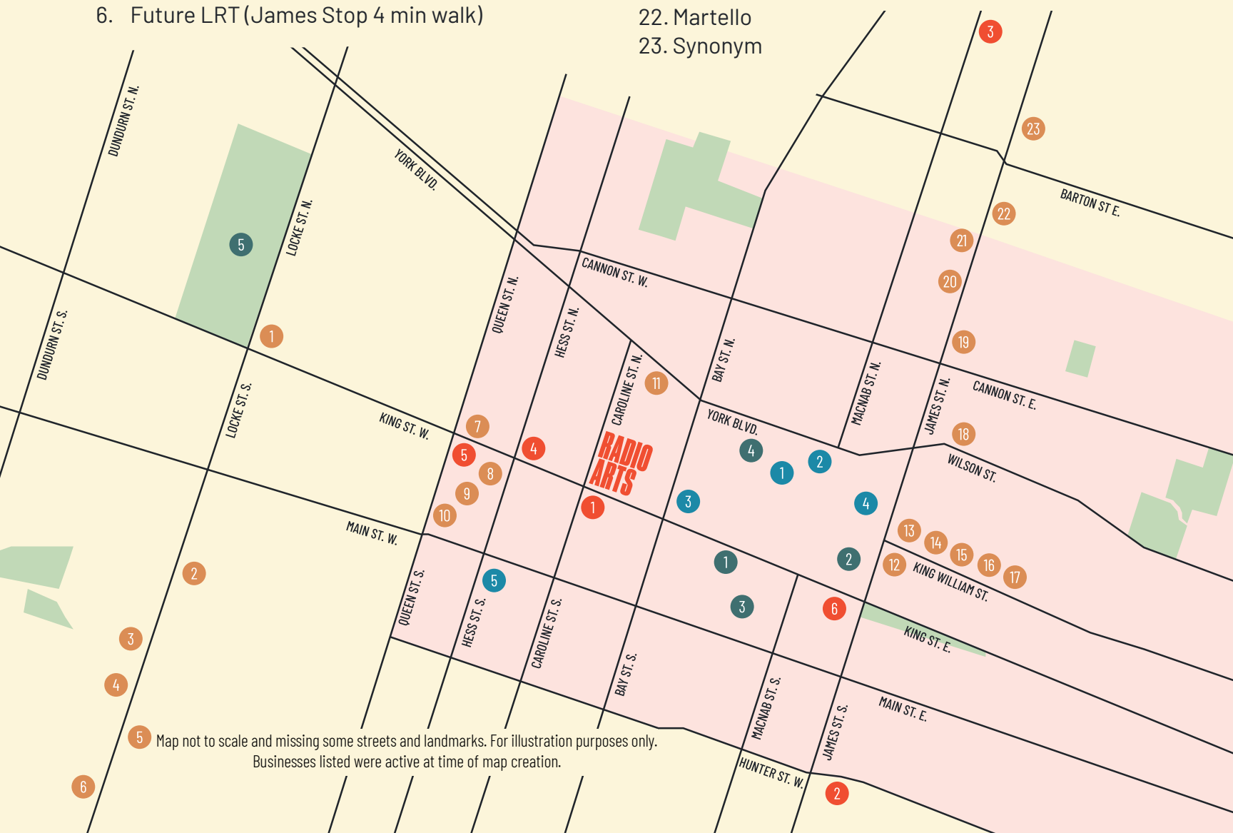
Map not to scale and missing some streets and landmarks. For illustration purposes only. Businesses listed were active at time of map creation.