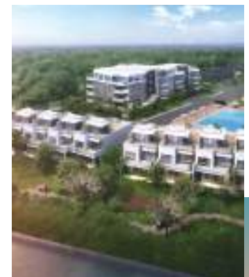
Fenelon Lakes Club