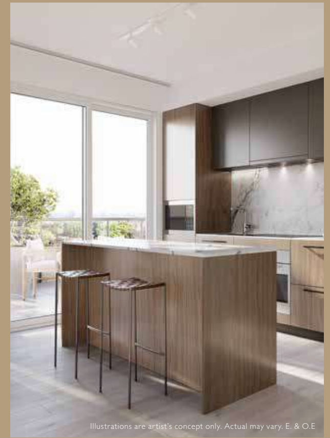
Illustrations are artist's concept only. Actual may vary. E. & O.E

Poised above the affluent neighbourhood of Leaside, the penthouses offer poetry embodied in views, space, & breathtaking design. Natural light flows in to bathe the open concept living area in a warm glow.