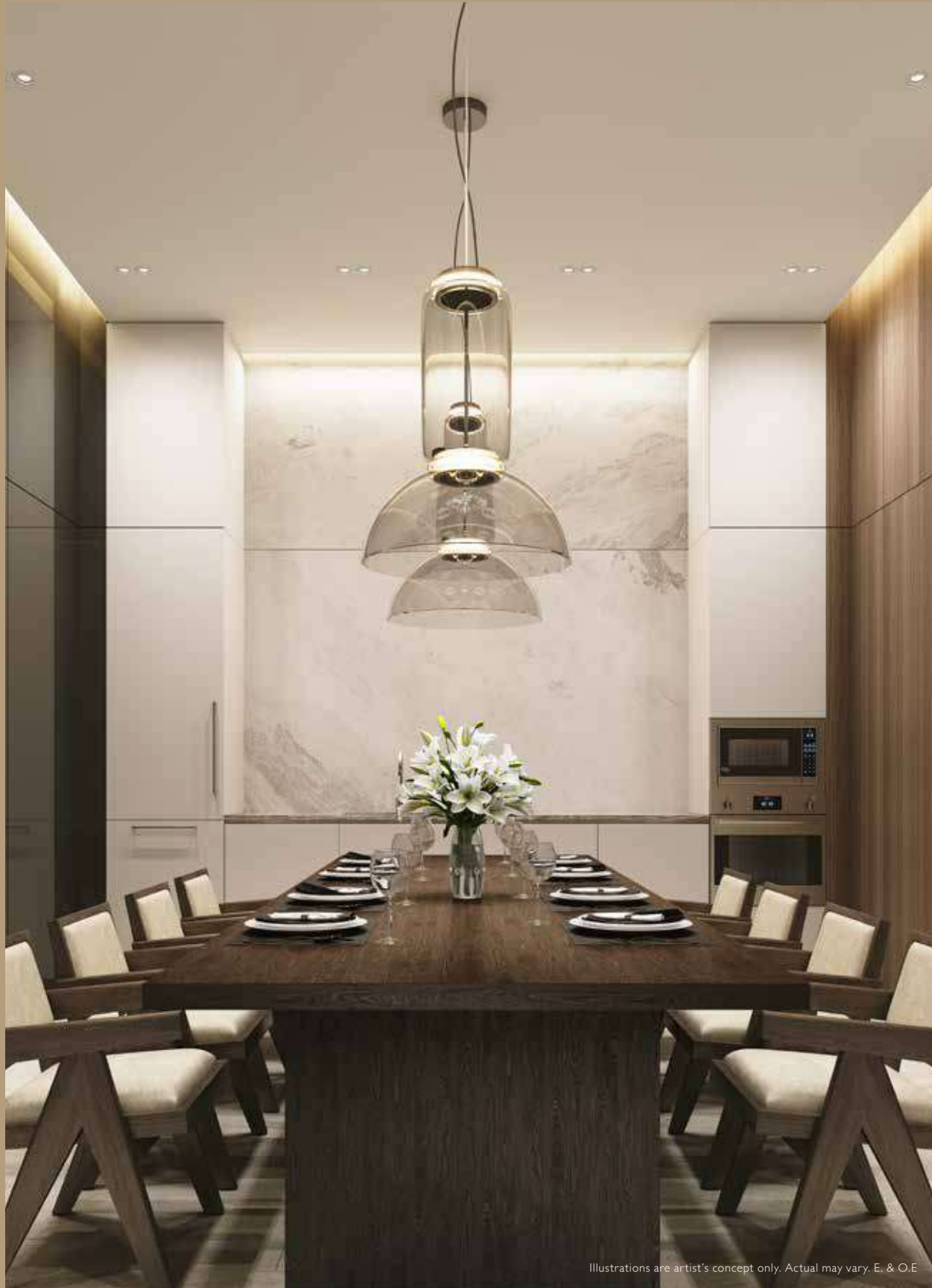
Illustrations are artist's concept only. Actual may vary. E. & O.E