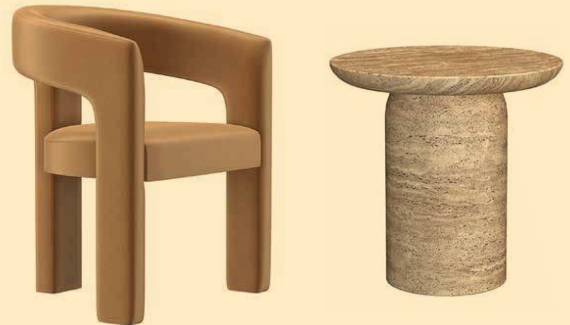
The furniture pieces depicted are for illustrative purposes only and may not necessarily be the ones procured for the project. In that event, furniture pieces of comparable style and quality will be procured.