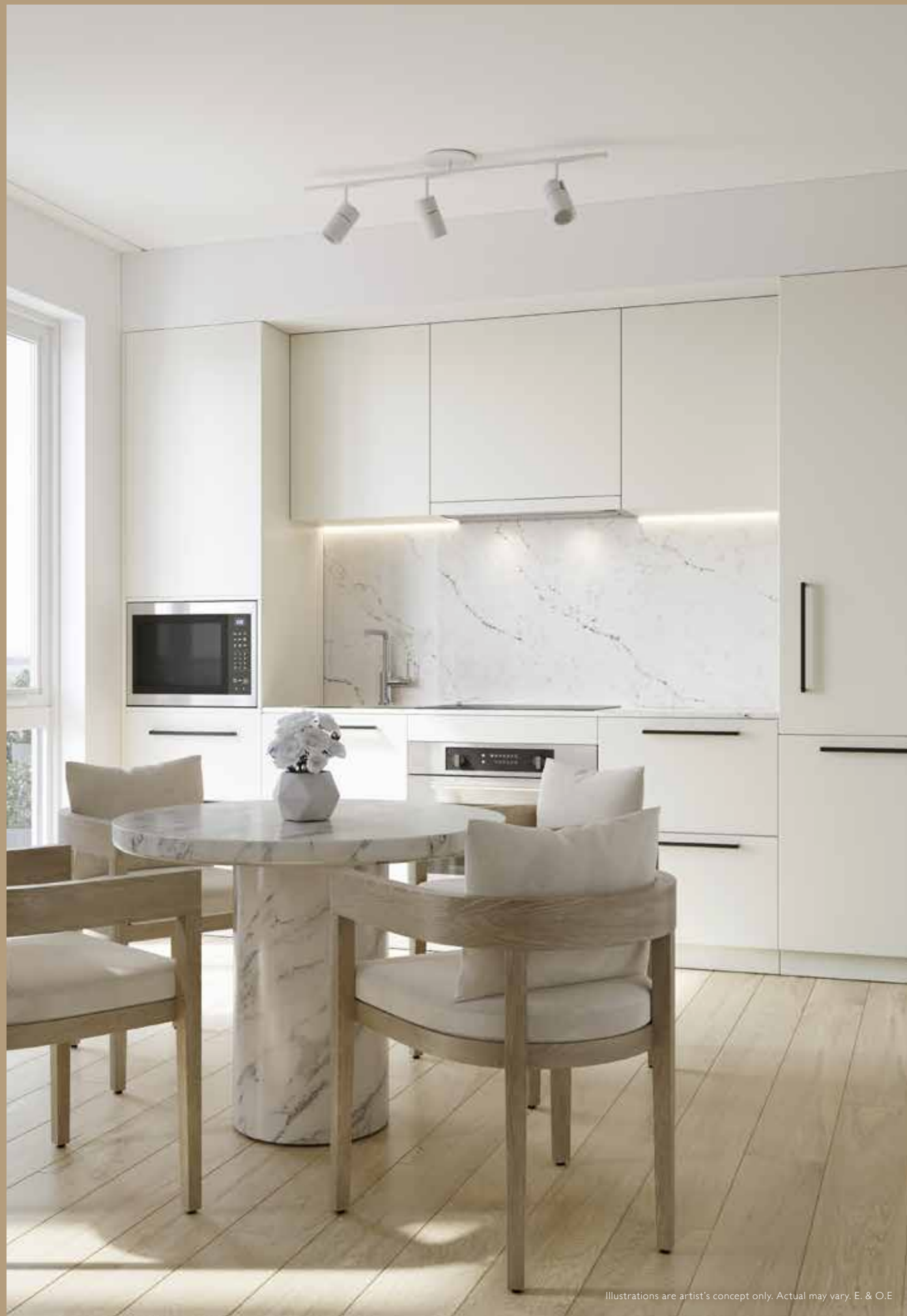
Illustrations are artist's concept only. Actual may vary. E. & O.E

Poised above the affluent neighbourhood of Leaside, the penthouses offer poetry embodied in views, space, & breathtaking design. Natural light flows in to bathe the open concept living area in a warm glow.