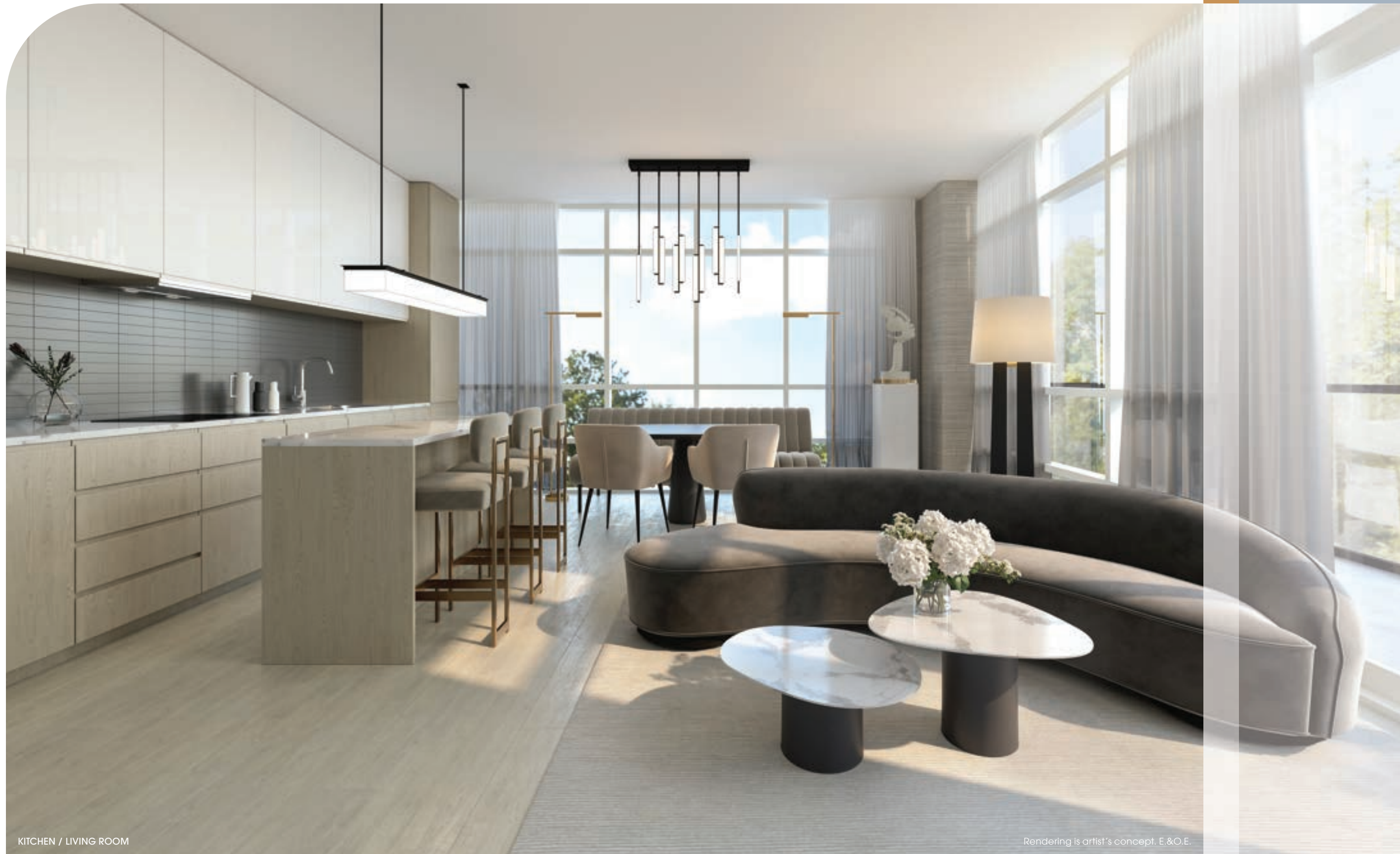
KITCHEN / LIVING ROOM