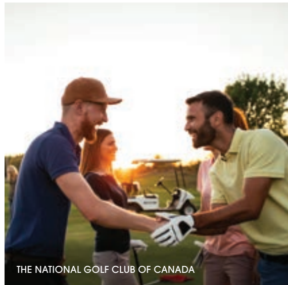
THE NATIONAL GOLF CLUB OF CANADA