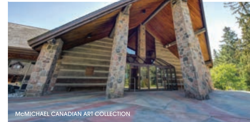
McMICHAEL CANADIAN ART COLLECTION

Visit Kleinburg's one-of-a-kind boutiques and restaurants, including family-owned Villaggio Ristorante, considered one of Vaughan's best fine-dining experiences.