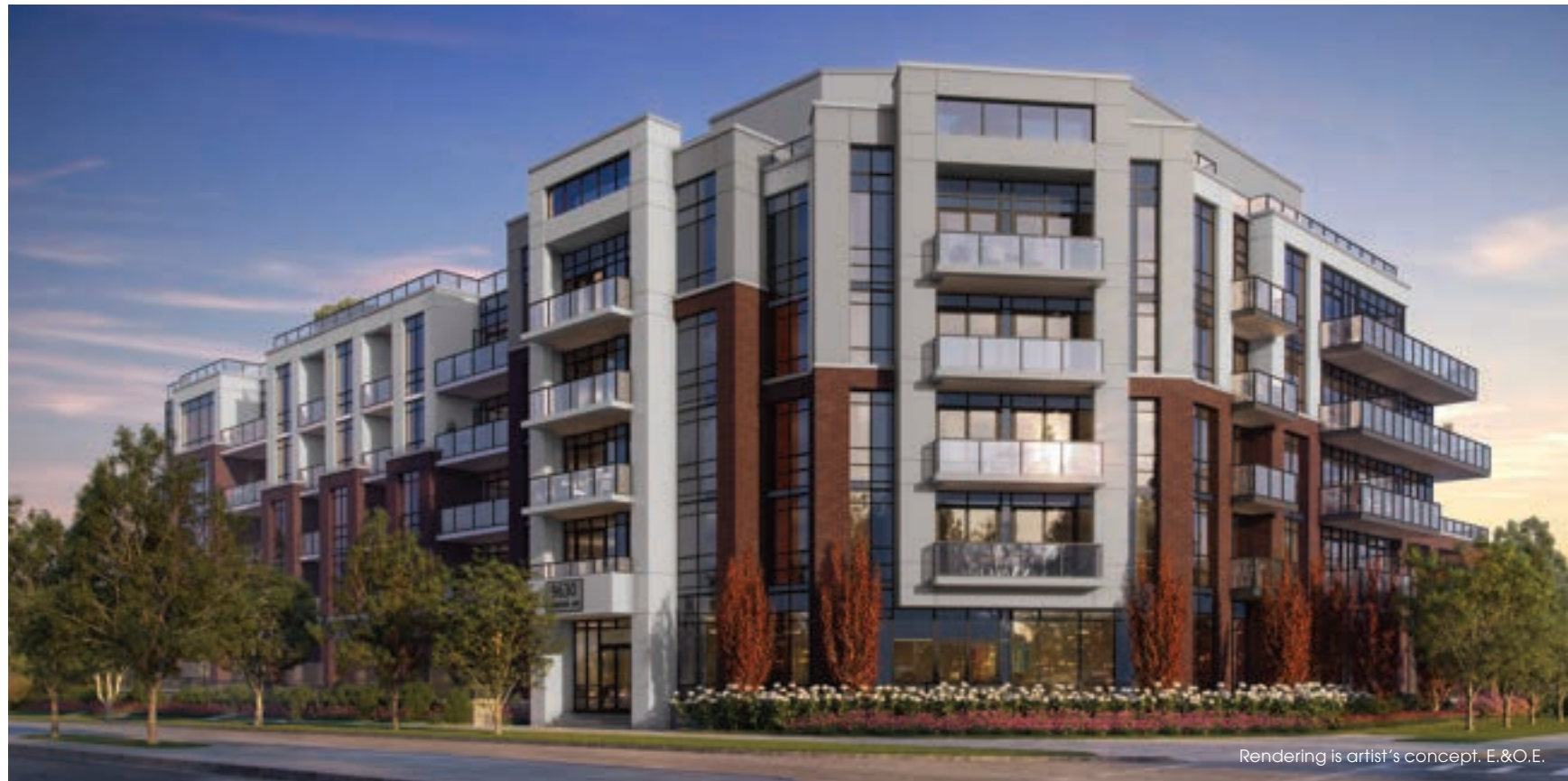
Rendering is artist's concept. E.&O.E.