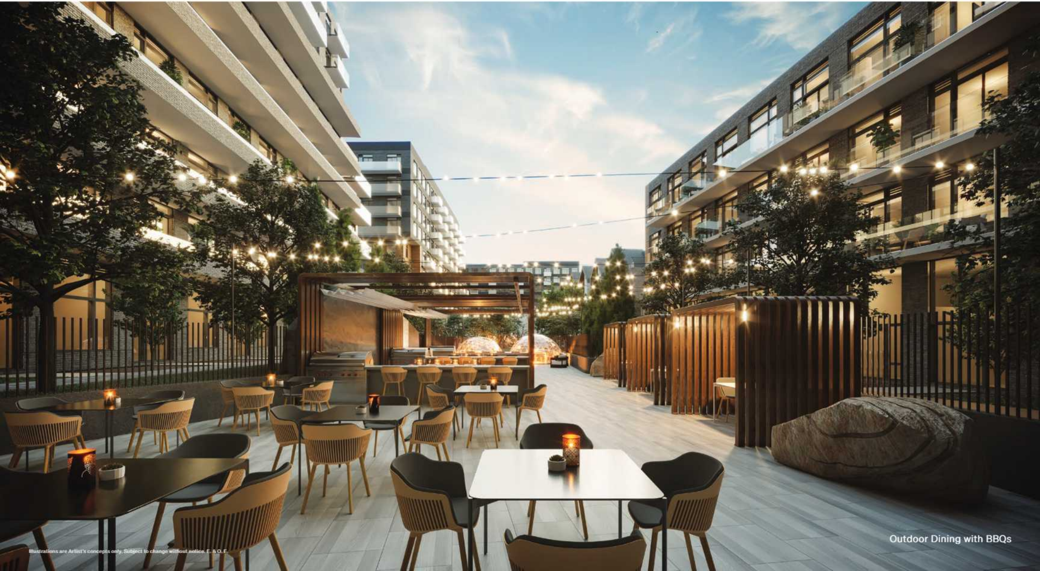
Outdoor Dining with BBQs

An expansive wood-hued terrace with a cozy fireplace, barbecues, private cabanas, and lots of tables and chairs makes it easy to spend as much of the warmer months outside as you like. In winter, the fireplace entices with its warm glow.