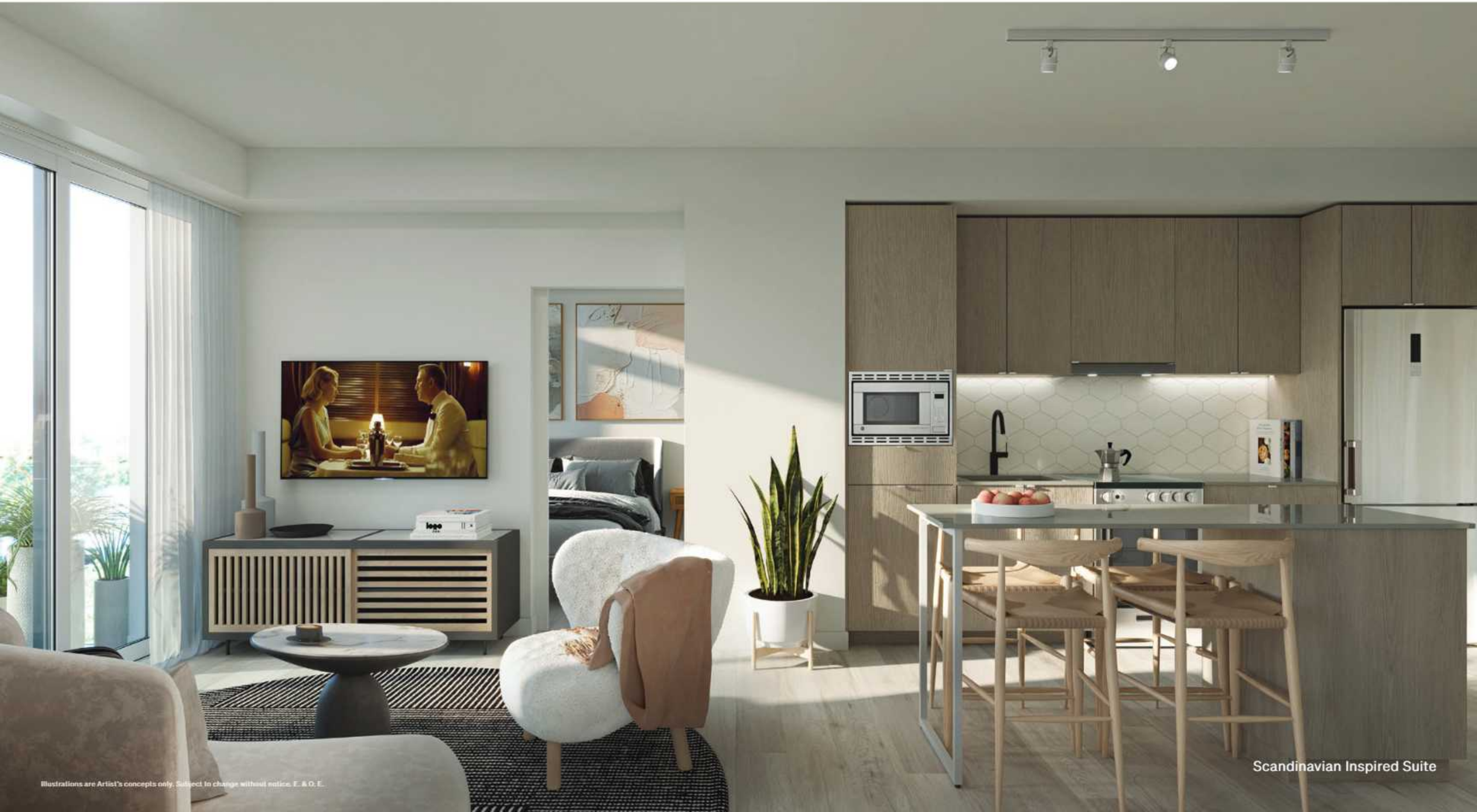
Scandinavian Inspired Suite

A relaxing retreat and the hub of your home life, the living area is as space-efficient as it is serene. With smart thermostats working for you for seamless comfort, you can always control your home's temperature from anywhere. Your modern kitchen/dining area is designed to enhance your culinary experience, whether you're entertaining guests or putting together a quick meal.