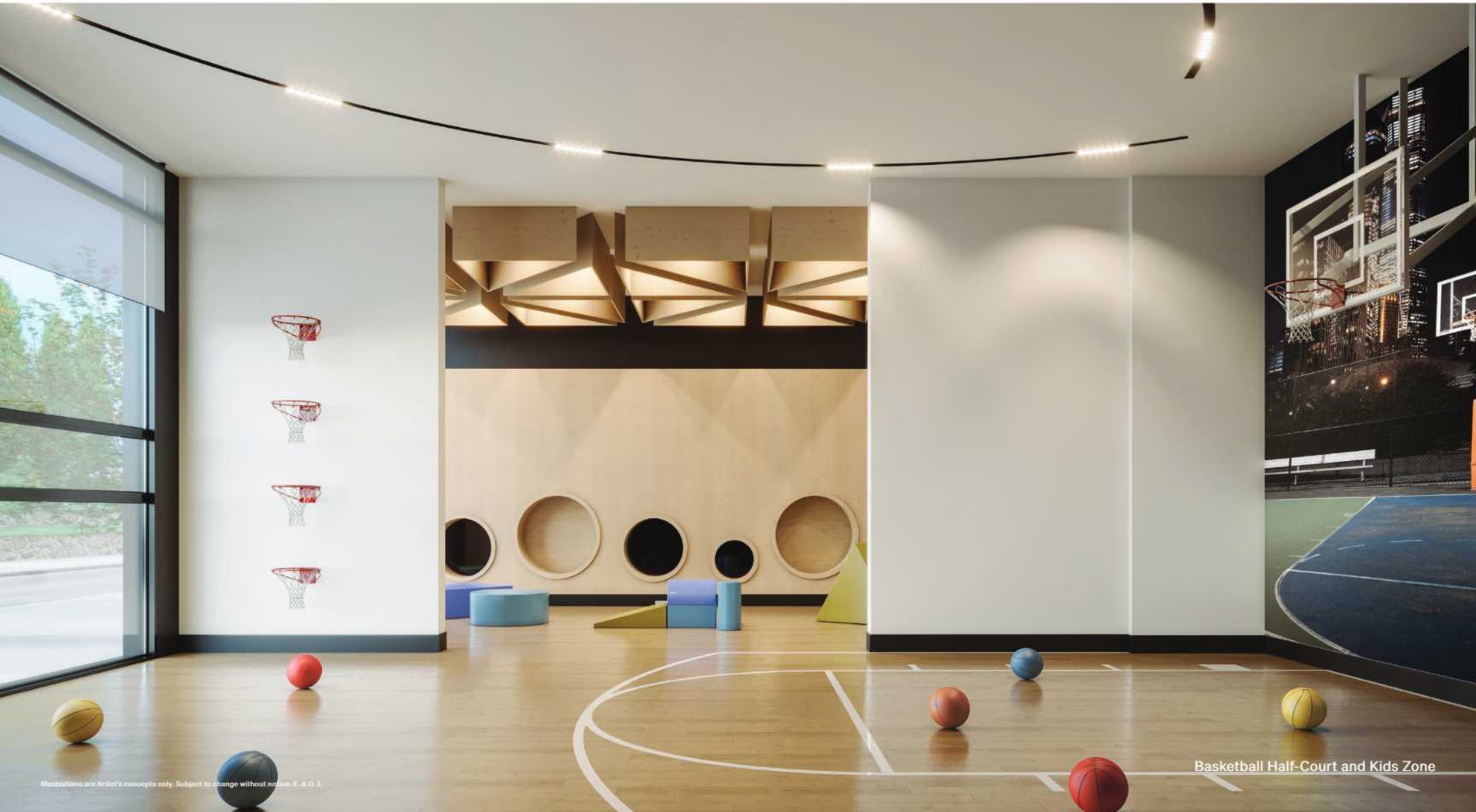
Basketball Half-Court and Kids Zone

Aspiring Raptors players or kids just looking to have fun at their favourite games will be thrilled to find a fully equipped gym with basketball half-court and practice baskets; an adjoining play space gives younger kids a place to explore and make new friends. In addition, the expansive fitness centre and relaxing spa with sauna make it effortless to work towards your health and fitness goals.