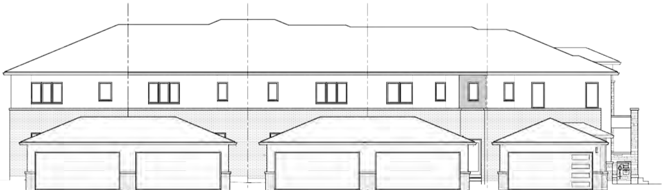
BEECH Elevation B Unit 5