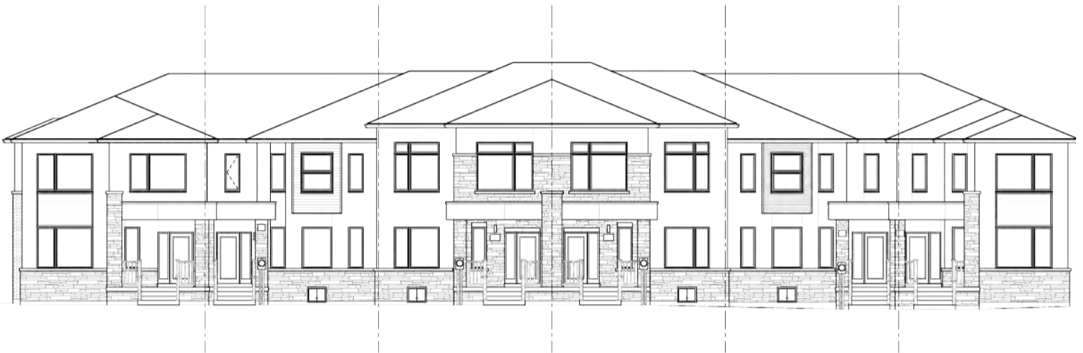
BUCKEYE Elevation B Unit 53