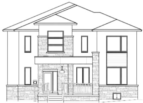
JUNIPER Elevation B Unit 64