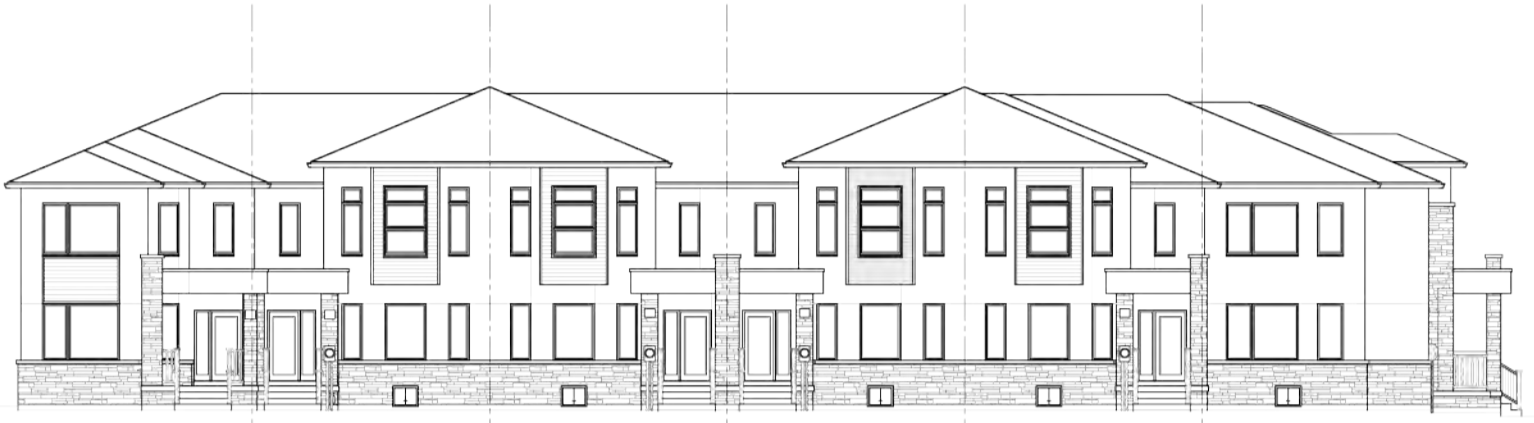
BALSAM Elevation B Unit 59