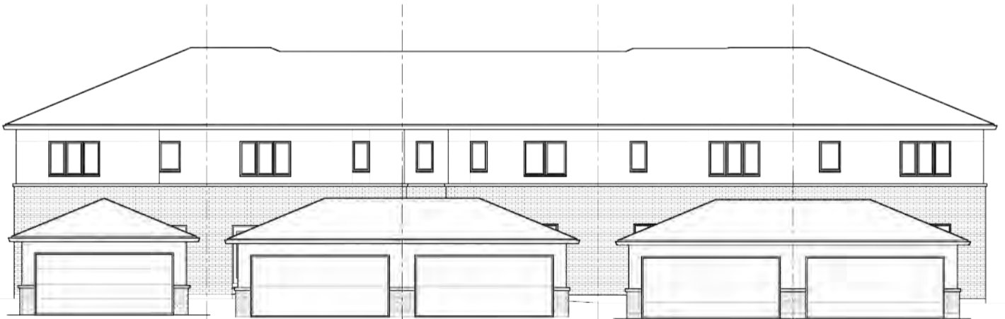
BEECH Elevation B Unit 10