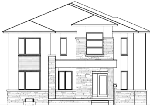
JUNIPER Elevation B Unit 1