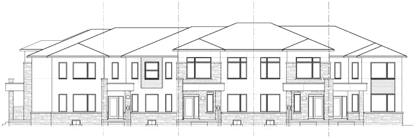
JUNIPER Elevation B Unit 1