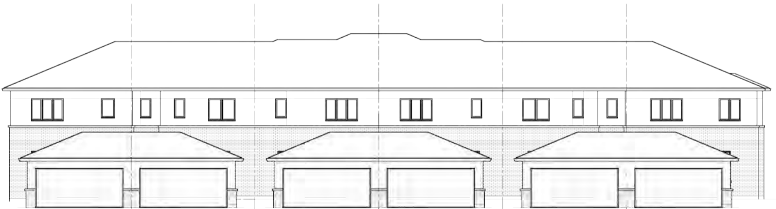
BALSAM Elevation B Unit 58