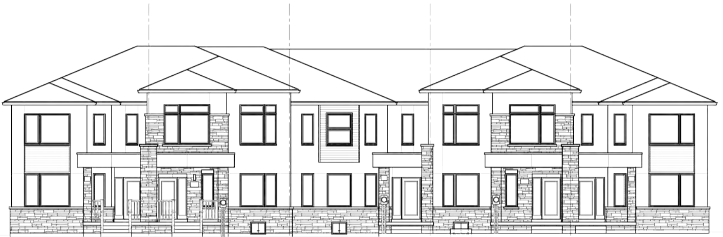
BEECH Elevation B Unit 6