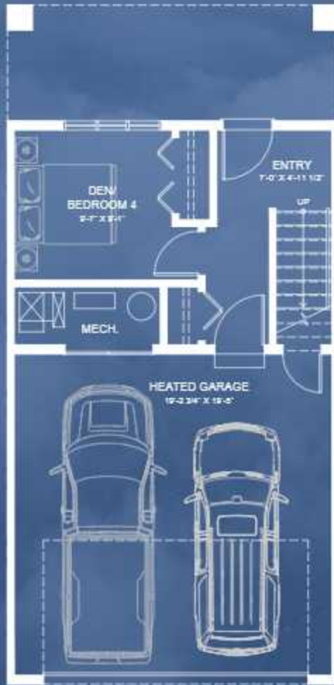
GROUND LEVEL ±211 SQ. FT.