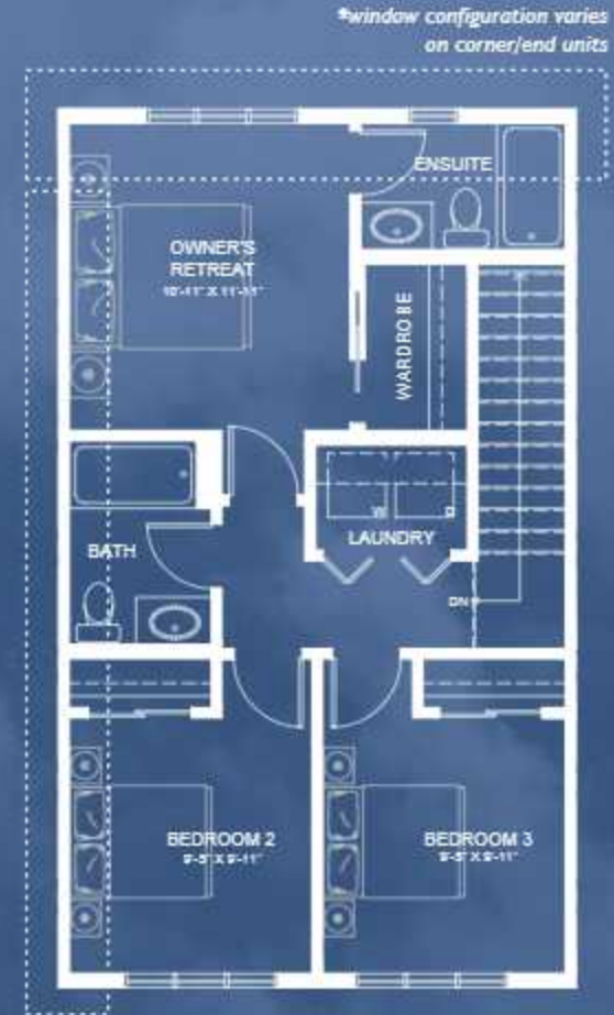
UPPER LEVEL ±680-732 SQ. FT.