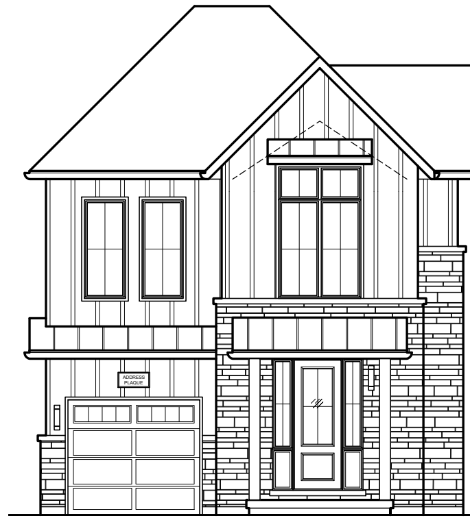
FRONT ELEVATION 'F'