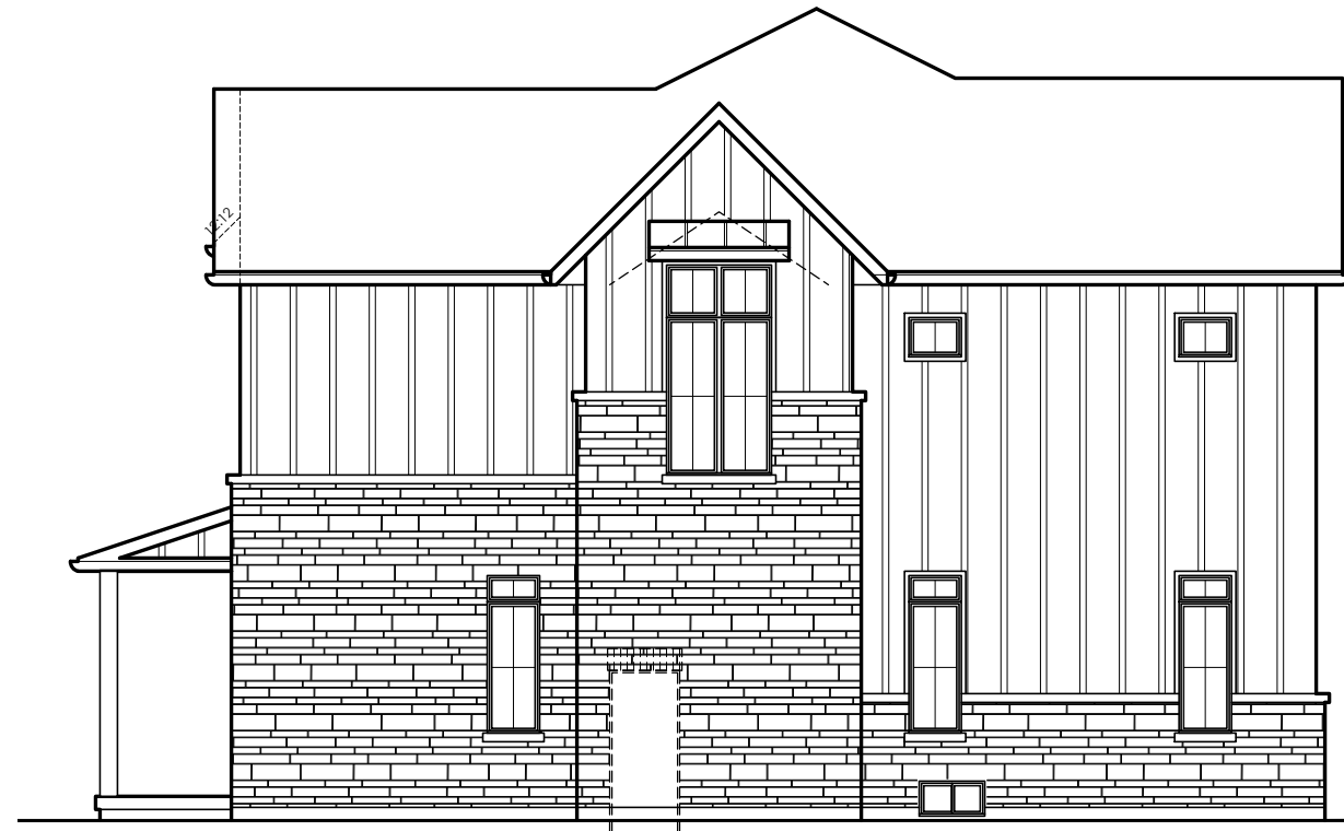
FLANKAGE ELEVATION 'F'