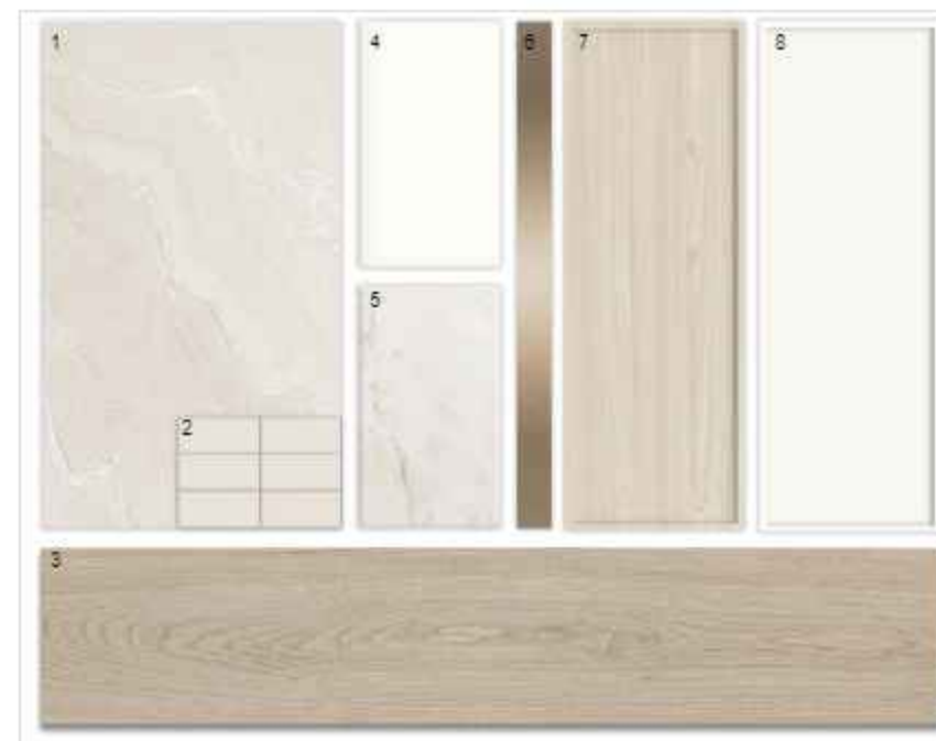
Example of upgraded finish palette - Light