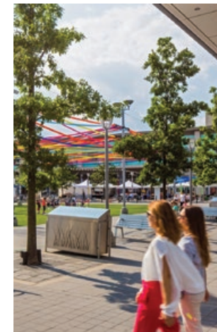
Shops at Don Mills

Connected to unique local offerings and stunning recreational spaces right outside your front door, Crosstown offers you the opportunity to explore premier Toronto attractions.