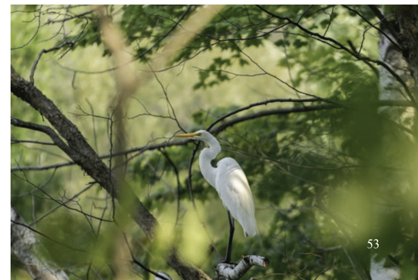
SUNNYBROOK PARK 13 minute walk from Crosstown