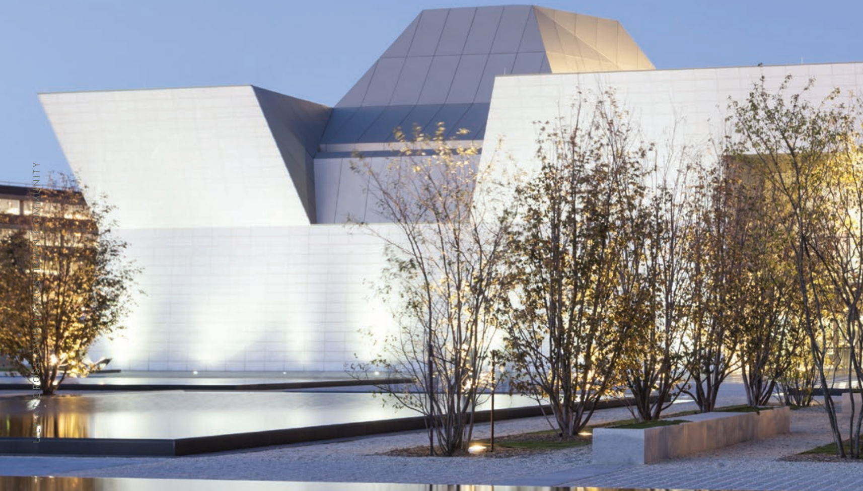
AGA KHAN PARK 8 minute walk from Crosstown