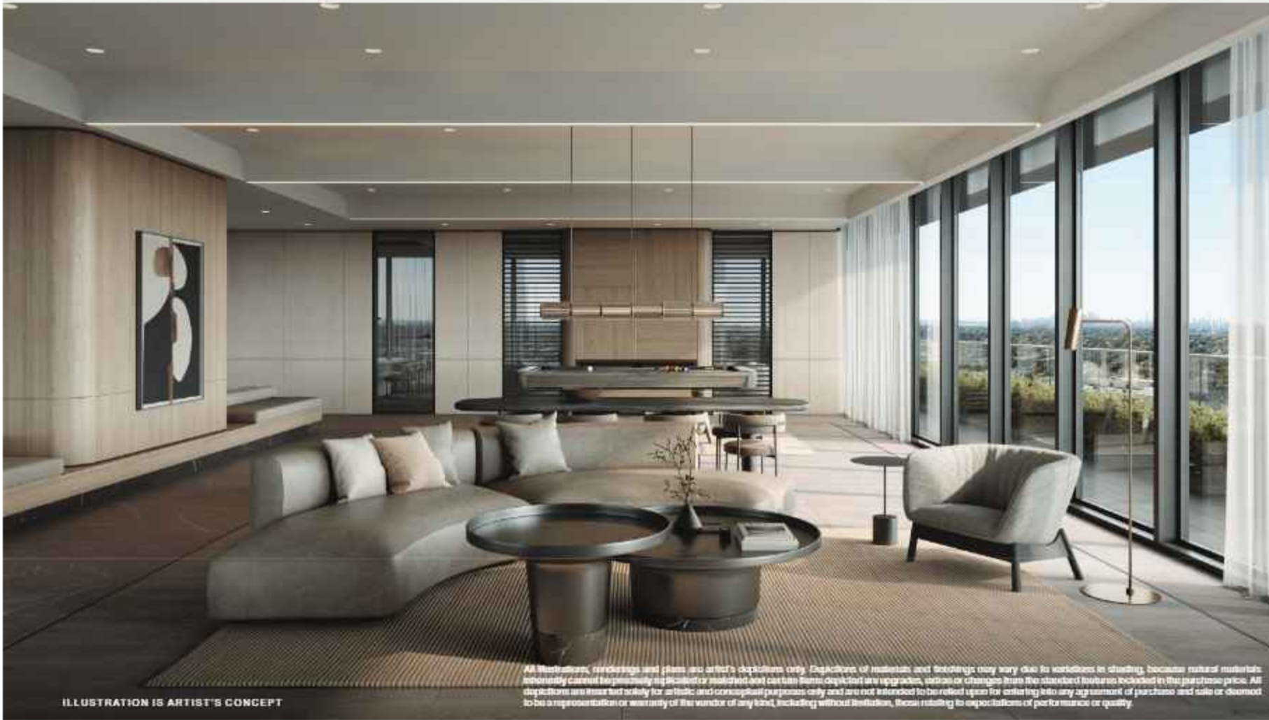
ILLUSTRATION IS ARTIST'S CONCEPT

All illustrations, renderings and plans are artist's conceptions only. Expectations of materials and finishes may vary due to variances in shading, because natural materials including wood and stone, are subject to environmental factors which may affect their color, texture or finish from the standard finishes included in the purchase price. All illustrations are meant solely for artistic and conceptual purposes only and are not intended to be relied upon for entering into any agreement of purchase and sale or deemed to be a representation or warranty of the vendor of any kind, including without limitation, those relating to expectations of performance or quality.