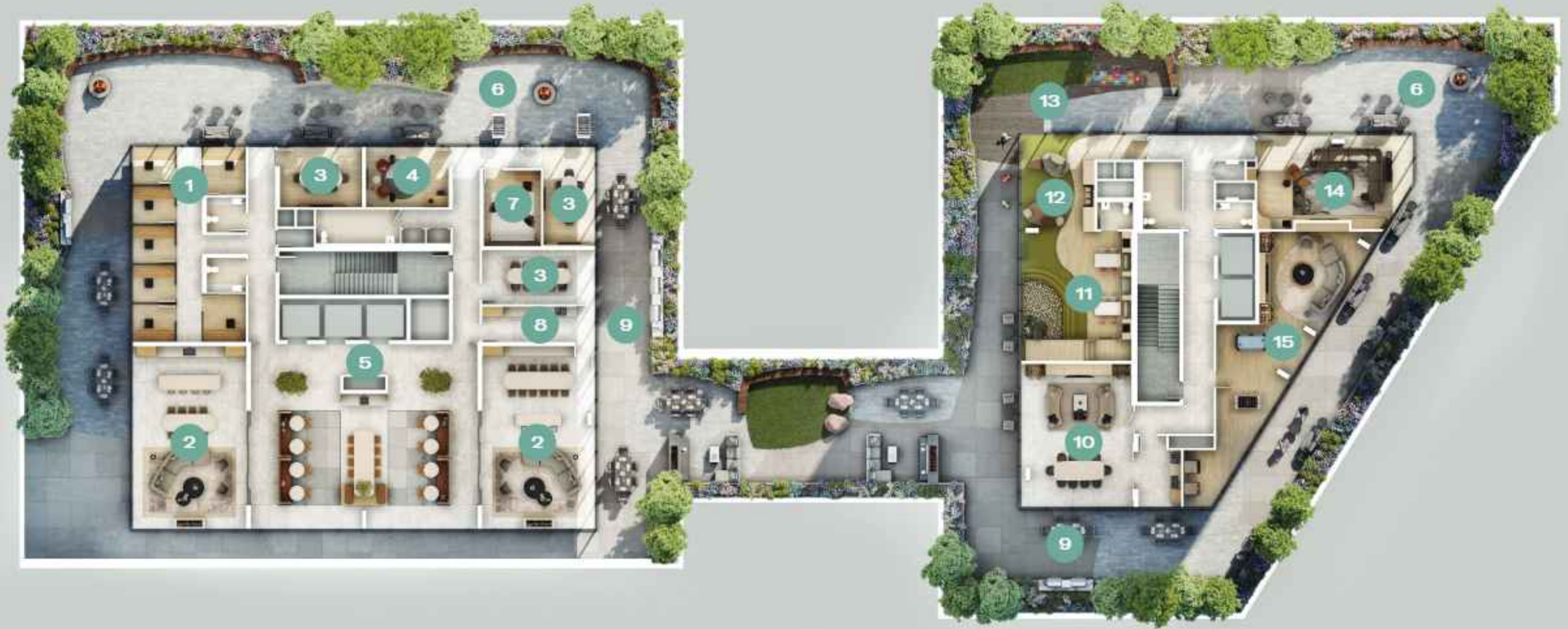
ILLUSTRATION IS ARTIST'S CONCEPT

All illustrations, renderings and plans are artist's depictions only. Depictions of materials and finishes may vary due to variations in shading, because natural materials inherently cannot be precisely replicated or matched and certain items depicted are upgrades, extras or changes from the standard inclusions included in the purchase price. All depictions are intended solely for artistic and conceptual purposes only and are not intended to be relied upon for entering into any agreement of purchase and sale or deemed to be a representation or warranty of the vendor of any kind, including without limitation, those relating to expectations of performance or quality.